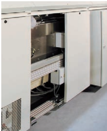
The machine is easy to access during maintenance

In the soldering zone high quality stainless steel is mounted. Large area heaters, mounted on the outside, are insulated against external heat radiation. Temperature measuring systems for heaters, fluid, vapour and cooling zone temperature guarantee utmost process reliability.