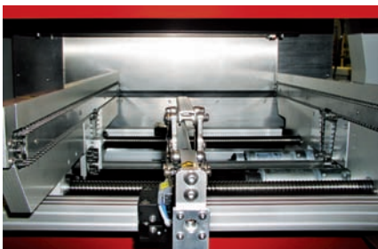
View into the conveyor system

The VP2000 series, depending on the model, processes assemblies from a size of 100 x 60 mm up to 750 x 620 mm.